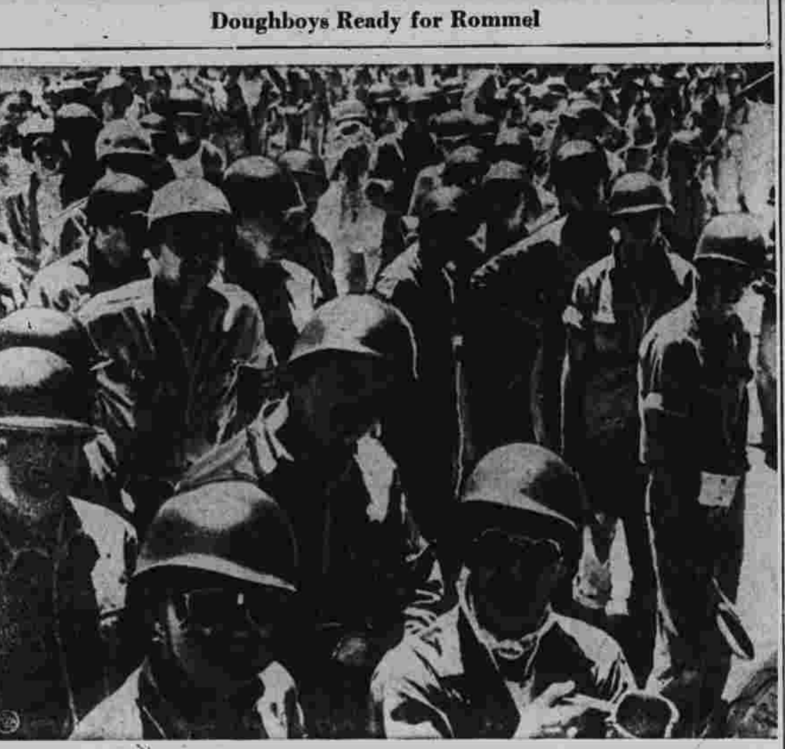
American soldiers, sent to Egypt to bolster the British line, are shown above as they lined up for their first show after disembarking with other reinforcements.

Washington, Sept. 3.—(AP)—The United States, Great Britain, Australia, New Zealand and Fighting France concluded today a series of reciprocal aid agreements designed to clarify the principles of mutual assistance in common struggle.